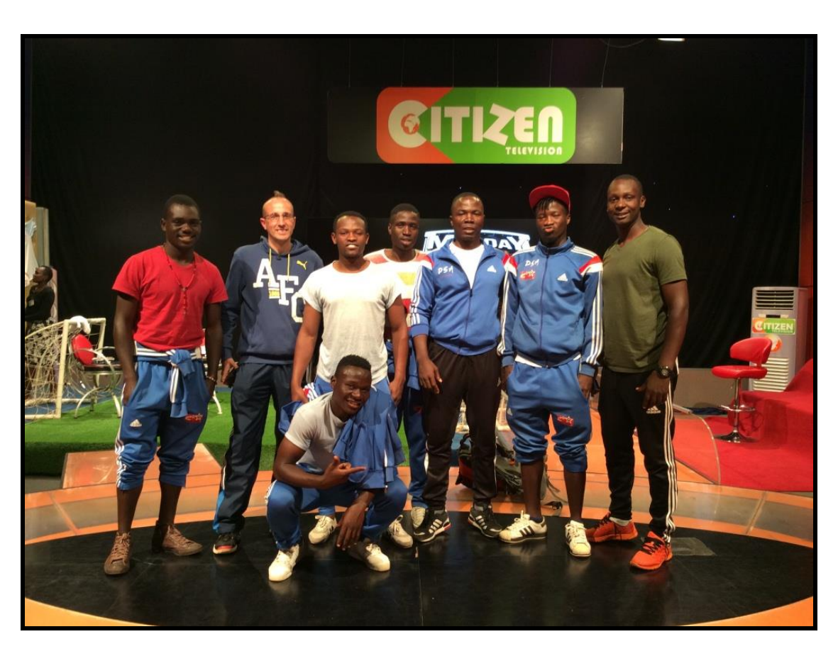
Let's shine together!