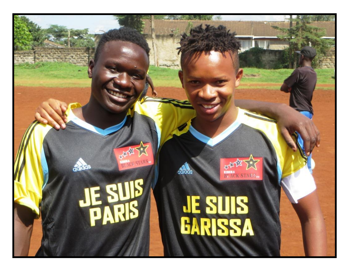
Let's win together!